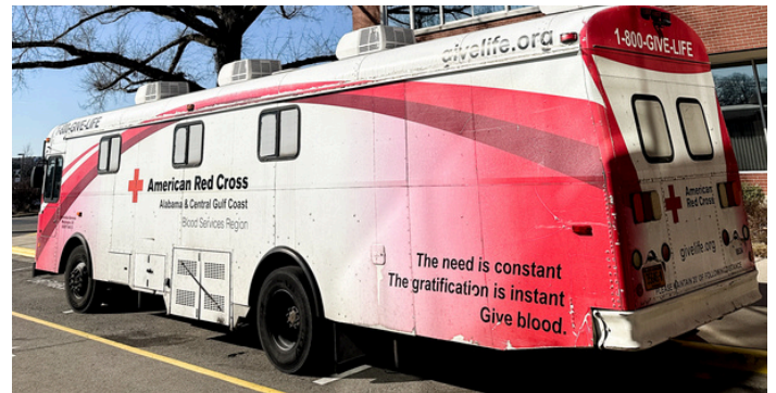
Northern hosted quarterly blood drives, collecting a total of 73 units, potentially saving 219 lives.