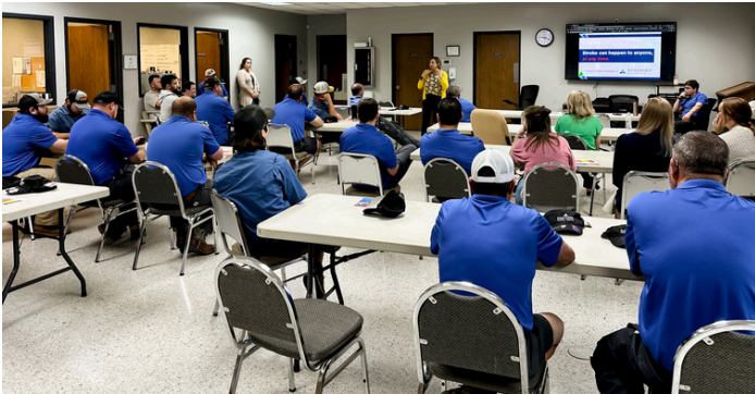
Northern provided free educational classes to local businesses and the community.