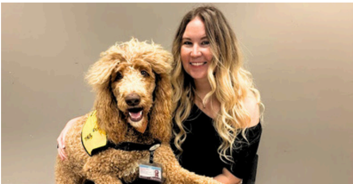
Northern introduced a Pet Therapy program to provide comfort, reduce stress, and bring smiles to our patients, families, and staff.