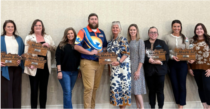
Northern is proud to be a Chamber Champion with the Greater Mount Airy Chamber of Commerce.