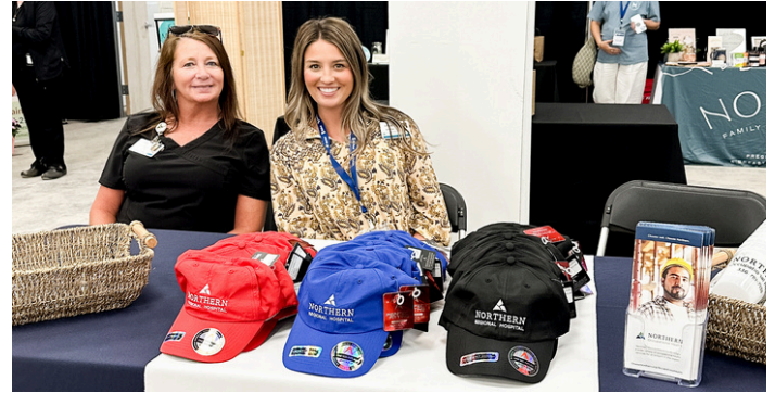
Northern participated in Bizfest, which allowed us to connect with local businesses and community members.