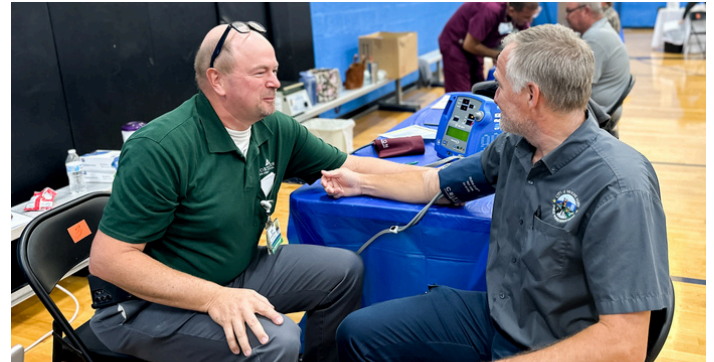
Northern hosted community health fairs to provide access to free screenings and services.